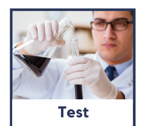
We'll send you a sample to evaluate.

PROUD TO BE A PART OF OCO ALLIANCE FOR CHEMICAL DISTRIBUTION