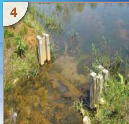
4 The result is CLEAN WATER that can be returned to the environment free from toxic residue.

Hoover Color pigments have been the industry standard since 1923. Whether you have a material or cost issue – or both - we can help. For engineered pigments with exceptional performance, quality and value, give us a call or email us today to get the conversation started. We will help you determine the right product for your specific application, and provide a sample for your evaluation.