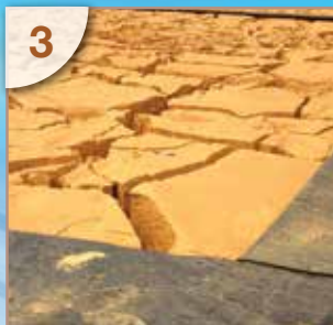
3 At a neutral pH, the iron can no longer stay in solution and precipitates out as iron oxide suitable for use as a pigment. When enough material is collected, it is harvested.