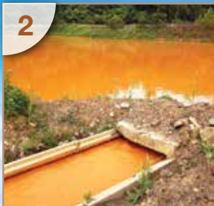
2 This polluted water is channeled through a series of wetlands and ponds that removes toxins and neutralizes the pH.